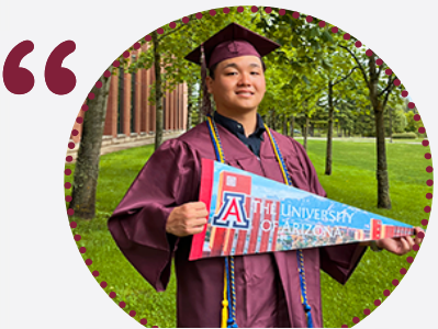
Baku, Japan Major : Anthropology University of Arizona

WCC taught me how to communicate with others, how to ask questions, how to state my opinion and how to be more confident. The faculty and staff here at Whatcom Community College are very knowledgeable, friendly and helpful. They helped me to stay on track with my transfer plan and guided me every step of the way during my university application process. What I enjoyed the most is that I didn't feel like an outsider - studying at WCC is like studying in your own home. Altogether, Whatcom community college has not only prepared me to transfer academically but also gave me an unforgettable college experience